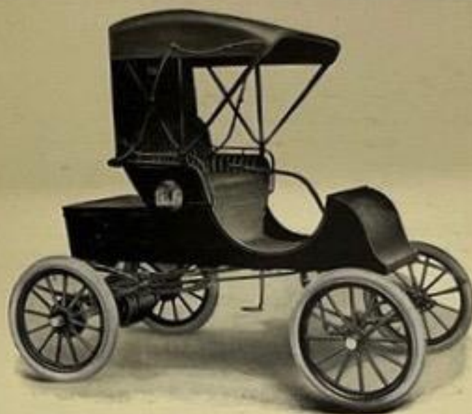
MODEL 36B Speed Road Wagon

Illustration shows neatness and compactness of patented hooded dash.