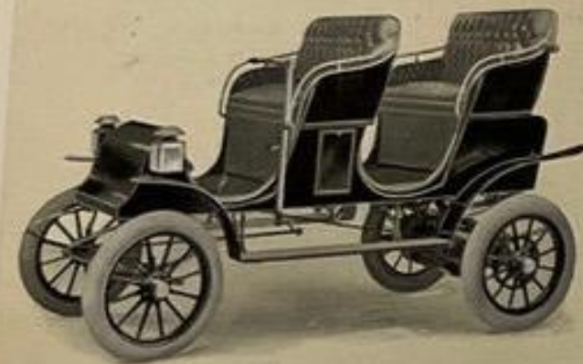
MODEL 60 Surrey