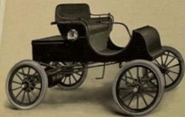
MODEL 36 Speed Road Wagon