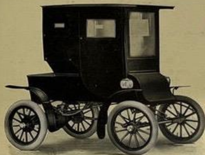
MODEL 29 C Physicians Road Wagon REMOVABLE CANOPY TOP AND GLASS FRONT