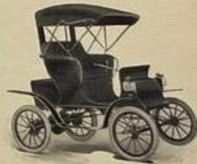
Stanhope with Buggy Top

A buggy top (see illustration) will be furnished instead when desired. The side curtains of this top are removable and rear curtain can be rolled up. It crushes back in nearly a horizontal position.