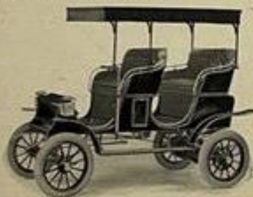
Model 60 C Surrey with Canopy Top

Tops —A canopy top at extra price of $75; a full leather extension top at an extra price of $100.