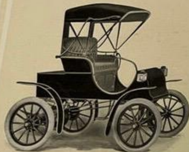
MODEL 29 Physicians Road Wagon