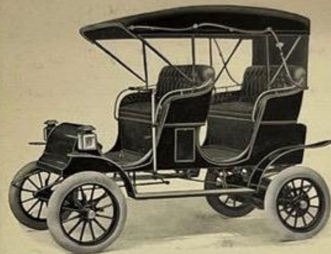
MODEL 60 B Surrey