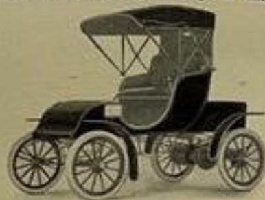
Model 26 B Chelsea with Leather Top