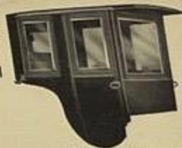
Showing Removable Coupe Top