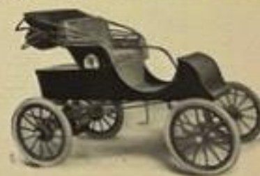
Model 36 B with Top Down