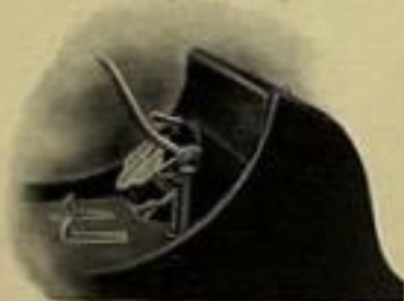
A Close View of Hooded Dash.

Illustration shows neatness and compactness of patented hooded dash.