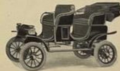
Model 60 B with Top Down