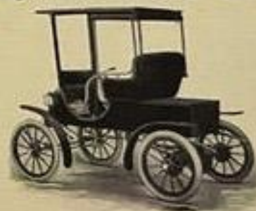
Model 29 C with Removable Canopy Top Open