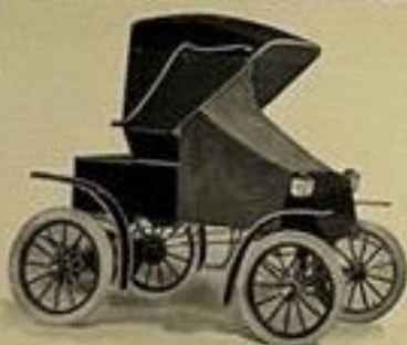
Model 29 Showing Stern Apron in Position