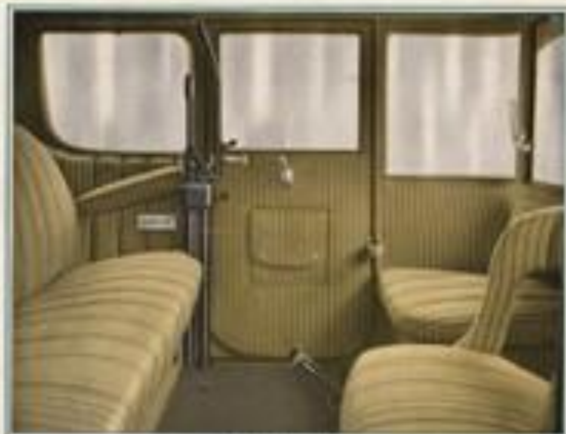
The interior of the Detroit Electric Car.

T HE rich lacquer finish of the exterior is permanent. Any desired color combination is obtainable in either dark tones or pastel shades, striped and monogrammed to order. This fine exterior appearance matches the modern body creations in quality and appearance.